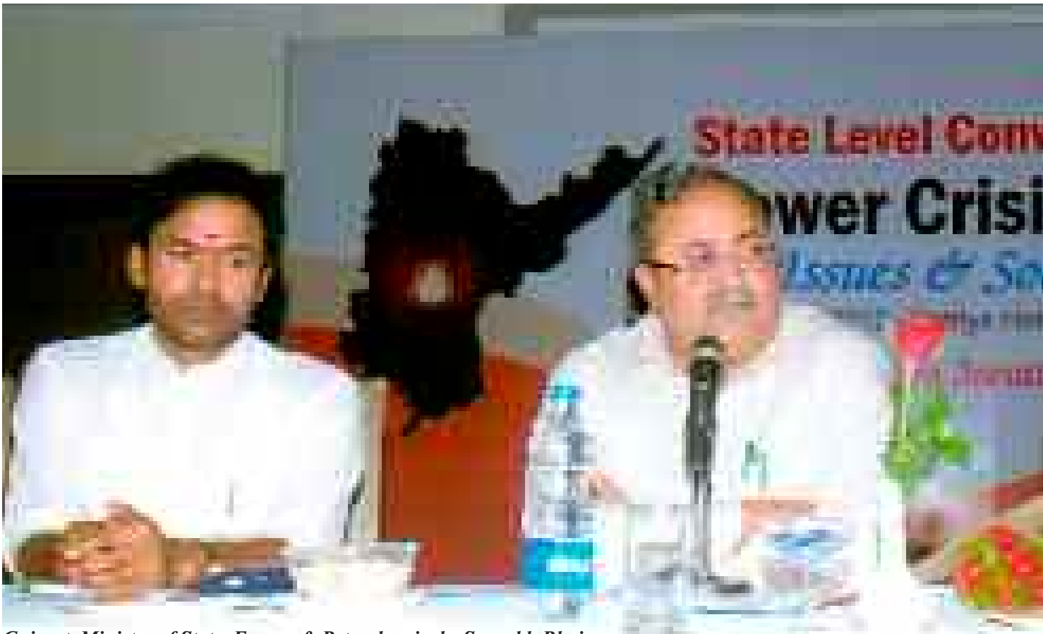
Gujarat Ministry of State, Energy & Petrochemicals, Saurabh Bhai Patel addressing the State level convention on power crisis in AP.