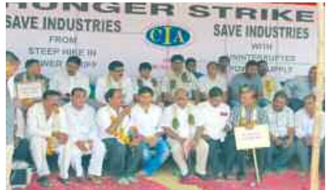
Members of Cherlapally Industries Association go on fast