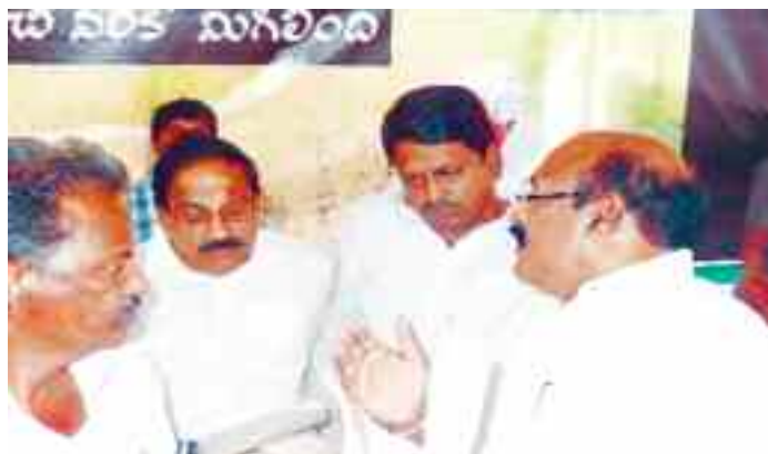
Thummala looking at FSME representation