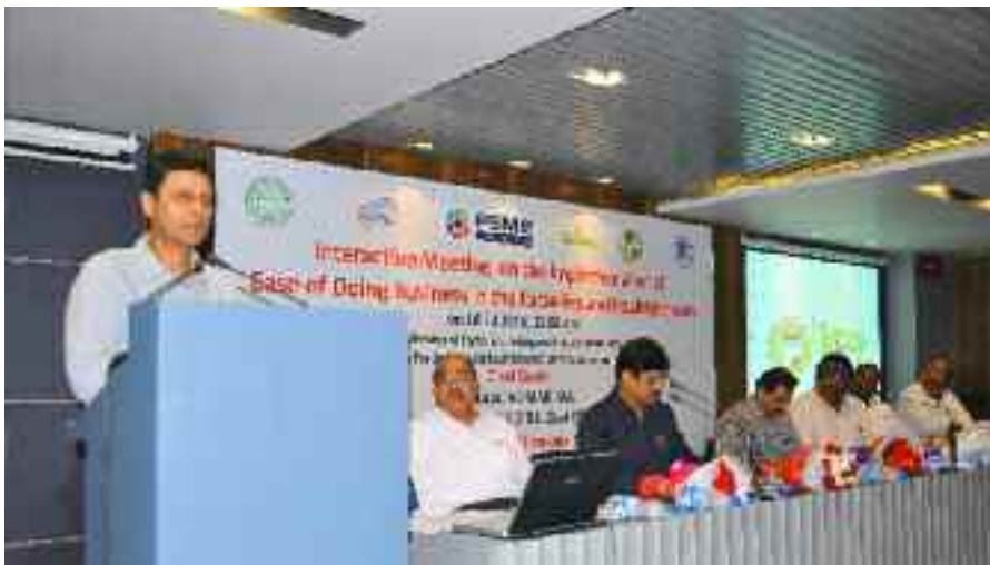
FSME India jointly organized with Associations COSME, an interactive Meeting on the implementation of Ease of Doing Business in the Factories and Establishments on 16th December 2016