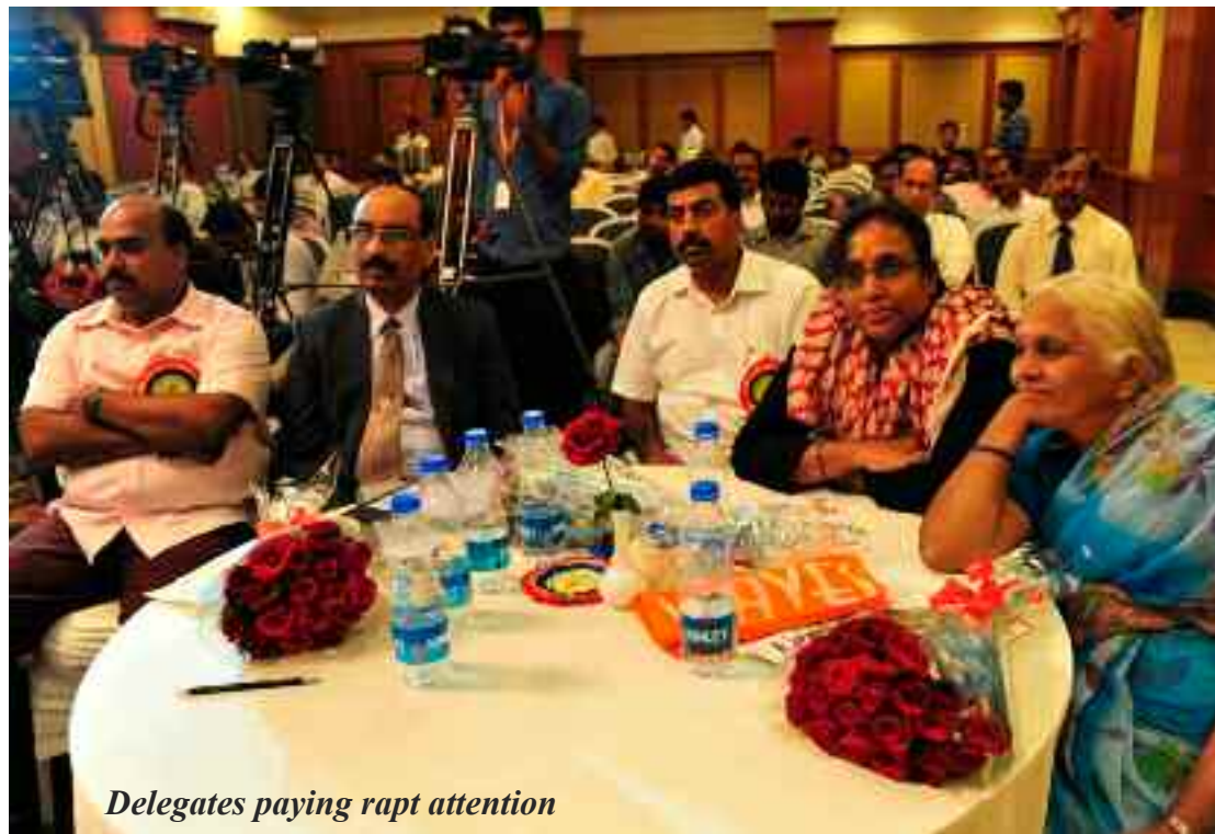
Delegates paying rapt attention