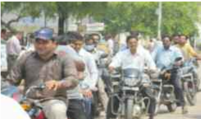
Kapra Micro Association members Kushaiguda take out a bike rally