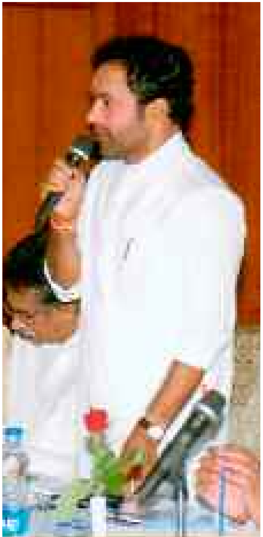
State BJP president G. Kishan Reddy

deal to the small and medium industry. Back in State, BJP has been actively participating in the programmes launched by MSME sector while highlighting their problems effectively across the State. Particularly when the State was afflicted by power crunch, BJP solidly stood behind the small and medium industry, by taking part in various protest programmes organized at every length and breadth of the State. For a change, its State leaders brushed aside political issues and expressed solidarity with the suffering industries, which were on the verge of closure following the severe power shortage in the State. It is to be recalled while at the national- level, BJP top leader Muralidhar Rao vowed to breathe new lease of life into the