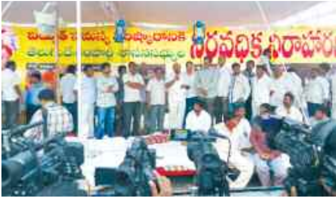
TDP MLAs on indefinite hunger strike